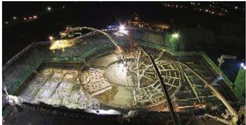
Figure 6: First Concrete at Sanmen Unit 1 March 2009.

Four Westinghouse AP1000 PWRs are being built in China, two in Sanmen, Zhejiang Province, and two in Haiyang, Shandong Province. The first of these is planned for operation in 2013. Ten more AP1000s are planned; three pairs at in-land sites, Dafan, Pengze and Tachuaiji; and two pairs at the existing coastal sites. China plans to achieve 80GWe of nuclear generation by 2020 and more beyond.