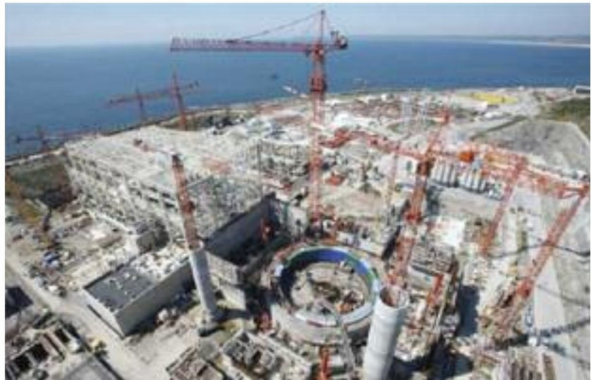
Figure 5: Flamanville 3 under construction 73 .

The board of directors of the utility Électricité de France (EDF) decided to instigate the process of building a new reactor at the Flamanville site in 2004, with the design contract for the new unit being awarded to Areva NP in September 2005. The public debate for the proposed power plant ran from October 2005 to February 2006 with a favourable opinion being obtained from the Commission Nationale de Débat Public (CNDP) in May 2006. The preparation of the site started in the summer of 2006 with the construction permit being granted in April 2007 70 and the first concrete being poured during December 2007. The original completion date for this project was 2012 at an estimated cost of €3.3 billion 71 . However, this date and estimated cost has been recently revised to 2014 and €5 billion, respectively 72 .