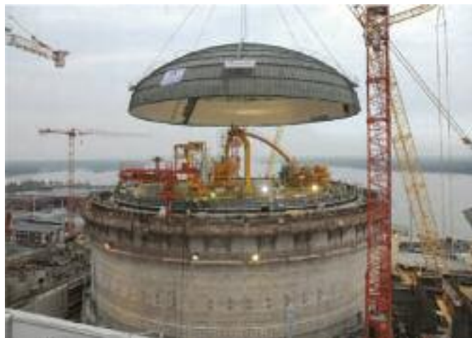
Figure 3: Positioning and installation of the steel containment liner dome on the EPR, Olkiluoto, Finland 43 .

The process of building the Olkiluoto 3 reactor started in June 1998 with the submission of the Environmental Impact Assessment (EIA) to the Finnish Ministry of Trade and Industry for two sites Olkiluoto and Loviisa, by the electricity generation company Teollisuuden Voima Oyj (TVO). Whilst the EIA does not come under the Nuclear Energy Act, it provides useful information that is used to inform the Finnish government when TVO applied for a Decision in Principle (DiP) in November 2000. The DiP is part of Finnish nuclear law and is granted by the government if a new nuclear power plant “is in line with the overall good of society”; there are no safety issues that can be foreseen as assessed by the Radiation and Nuclear Safety Authority (STUK) and the host municipality agrees to the site of the new power plant. A positive DiP was made by the government in January 2002 and was ratified the following May by parliament.