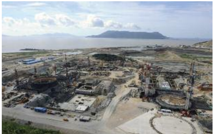
Figure 8: The EPR site in China: Taishan 1 (left) and Taishan 2 (right) in July 2010

Of note is that construction is not the only part of project delivery that sees improved performance since engineering for the electro-mechanical scope of the Nuclear Steam Supply System has seen its productivity increased by a factor of 4 between Olkiluoto 3 and the Taishan projects.