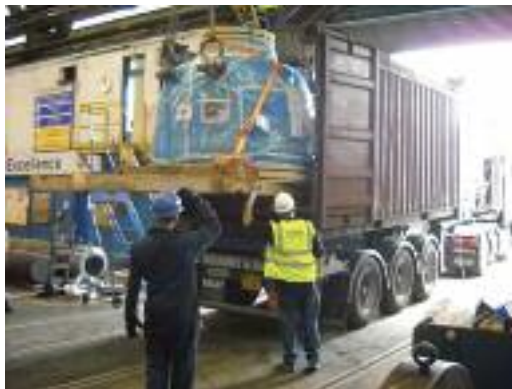
Figure 7: Reactor Coolant Pump Casing Shipping from Sheffield Forgemasters (UK)

600 has been eliminated. The digital instrumentation and control systems used have been back-fitted into operation plant which provides evidence and practical experience and extensive computer software verification and validation.