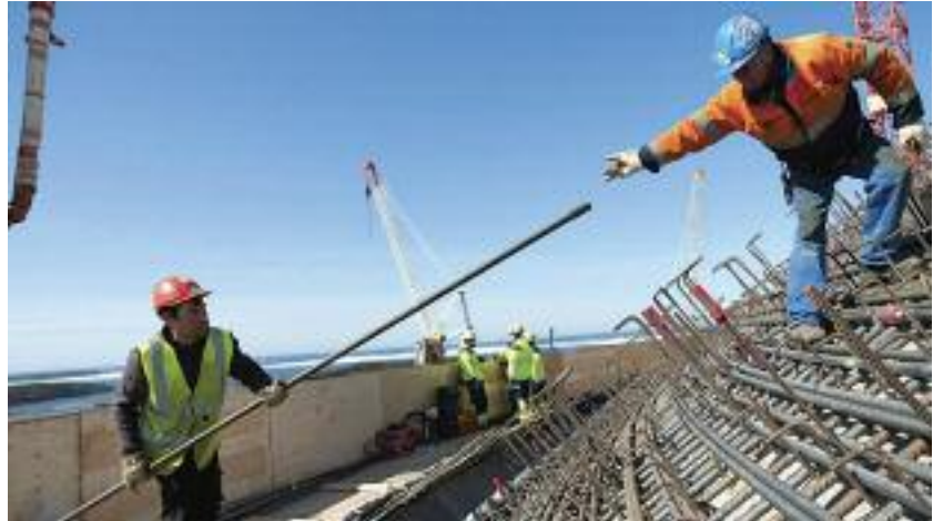
Figure 4: Reinforcement being fitted to the reactor dome at Olkiluoto 3 (May 2010) 64 .

section of the steel liner, a 14m-high dome, was fitted to the reactor building in September 2009. Once the welding was complete, this provided a weather-tight seal to the reactor building that allowed the internal work to proceed 61, 62 . Currently the construction work is continuing with the dome of the reactor being covered by a thin layer of concrete during April 2010 and it is to be followed by a thicker reinforced layer, for which the reinforcement is currently being fitted. Once this second layer of concrete is poured the inner wall of the reactor building will be completed and work will start on the dome of second, much thicker, impact-resistant wall 63 .